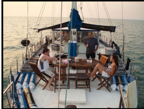
The MB Cecelia Ann at sea

time to oxygen clean the boats tanks prior to departure to enable us to blend nitrox or other gases on board. Decompression tanks will be Al 80 cu ft ( 11 liter ) cylinders with oxygen, with rigging provided by us.